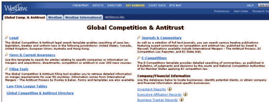
Tabbed Global Competition and Antitrust page

The tabbed Global Competition and Antitrust page provides easy access to topical resources that help you research global competition and antitrust issues and stay up-to-date with policy developments. Information on the page is organized by source so that you can quickly access the information you need. To begin your research, click an information category to access a Search page.