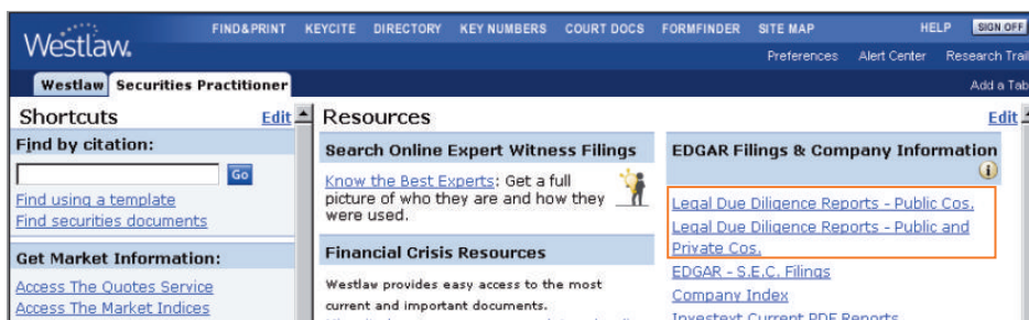
Figure 1. Tabbed Securities Practitioner page

To select the Securities Practitioner page for your current research session, click Add a Tab at the top of any page. At the next page, click Add Westlaw Tabs to display a list of available tabbed pages, then click Securities Practitioner under Topical .