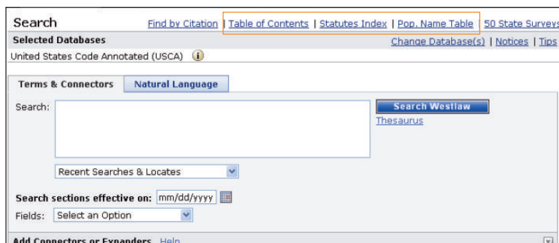
Figure 3. USCA Search page

You can also begin your research by typing a Terms and Connectors query or a Natural Language description in the Search text box and clicking Search Westlaw .