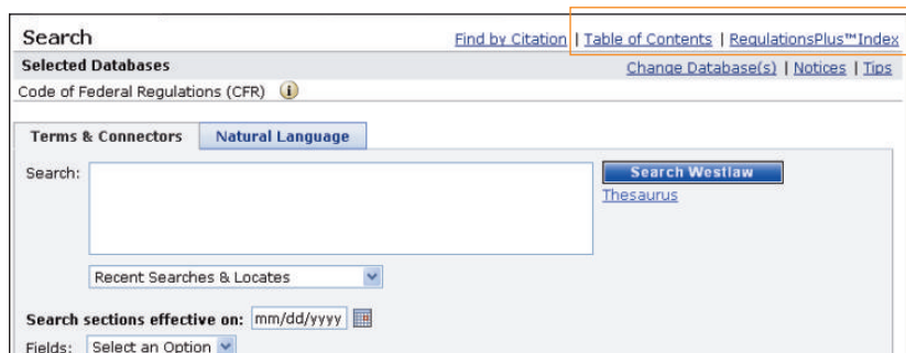
Figure 1. CFR Search page

You can also begin your research at a Search page by typing a Terms and Connectors or Natural Language search in the Search text box and clicking Search Westlaw .