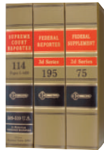
Figure 2. West reporters

Published cases can be found in the print volumes of West's National Reporter System (Figure 2). This system consists of three main subdivisions: