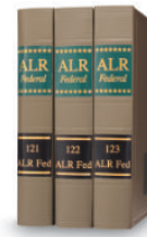
Figure 4. American Law Reports

American Law Reports (ALR®) contains attorney-written annotations that cite, summarize, and analyze the case law on a particular legal issue or fact situation (Figure 4). These annotations contain many citations to cases and secondary materials. ALR is updated annually with supplementary inserts.